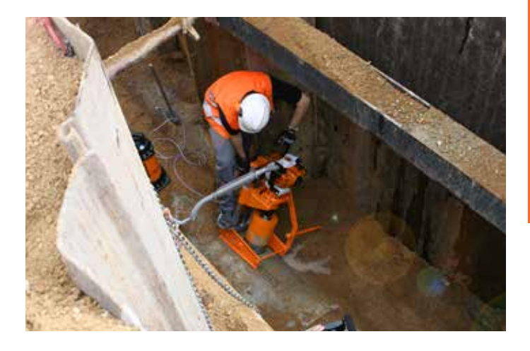
90° Drill in sewage pipe. Fixing by ground spikes