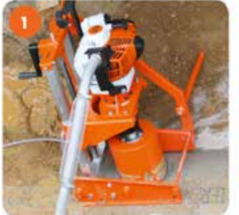
90° Drill in sewage pipe. Pipe base clamped between concrete pipe and trench and secured by ground spikes.