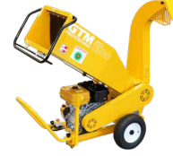
GTS1310S - HIRE